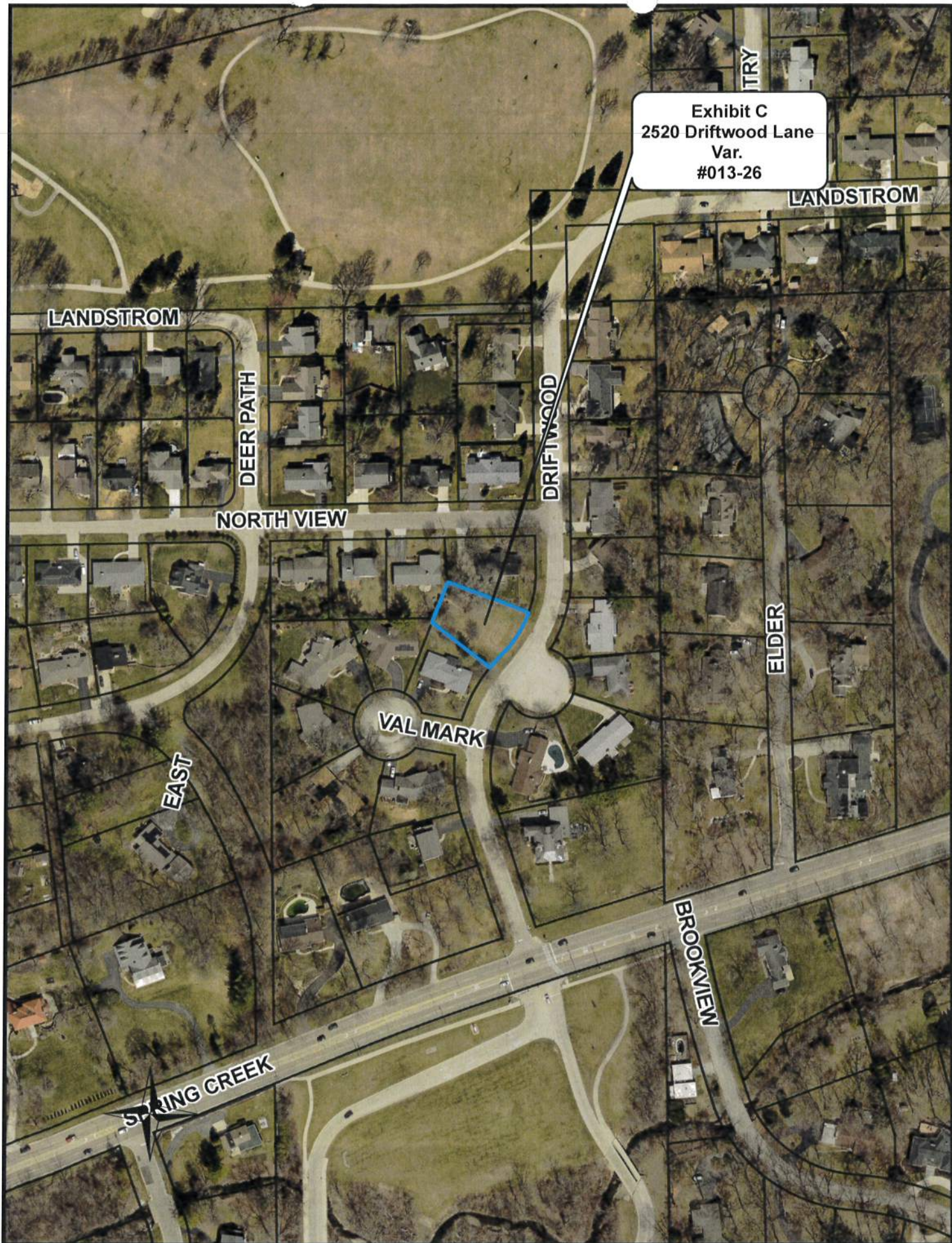
Exhibit C 2520 Driftwood Lane Var. #013-26