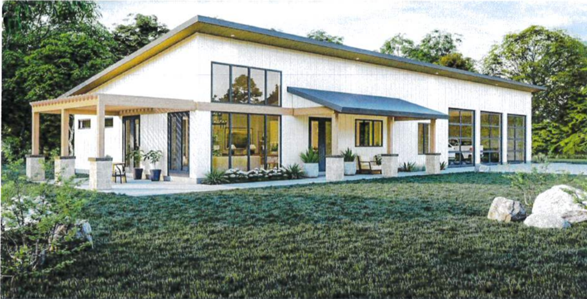
Exhibit E 2520 Driftwood Lane Var. #013-26