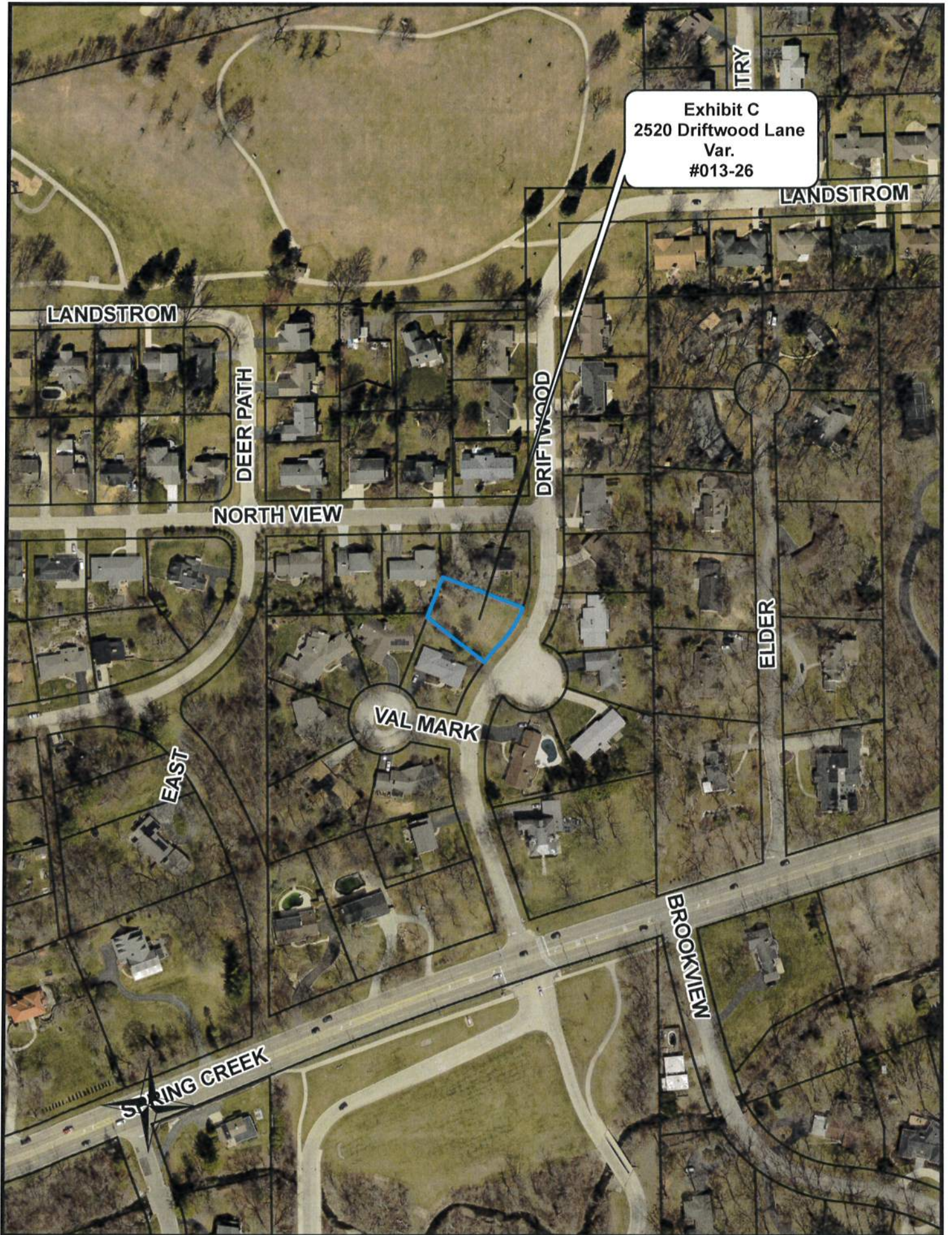
Exhibit C 2520 Driftwood Lane Var. #013-26