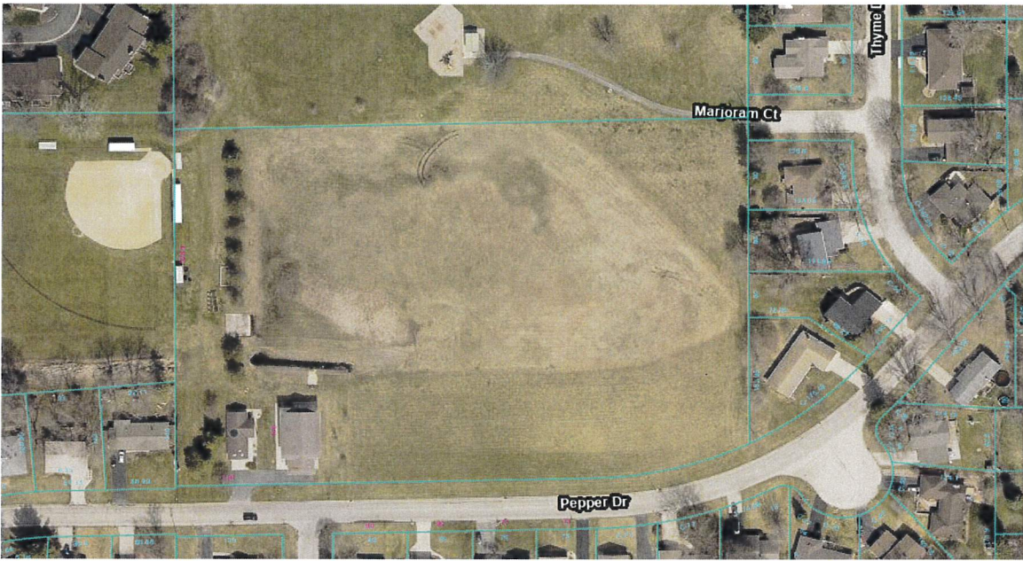
1338 Derby Lane